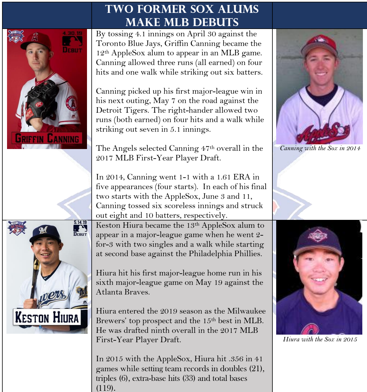
Canning with the Sox in 2014